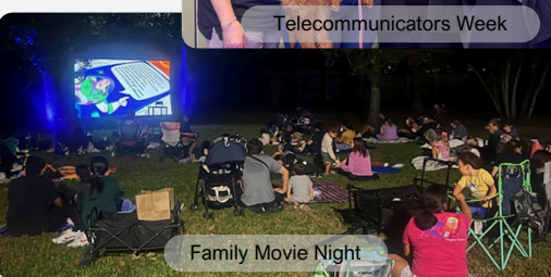
Family Movie Night