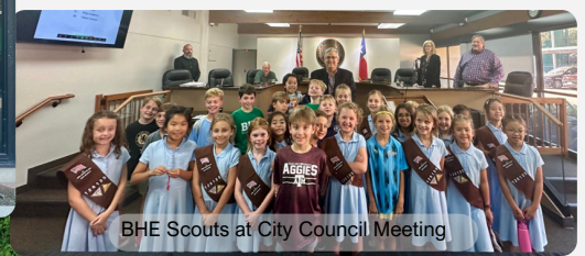
BHE Scouts at City Council Meeting