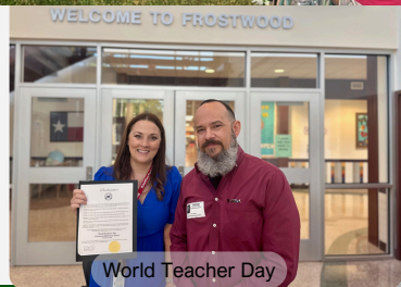
World Teacher Day