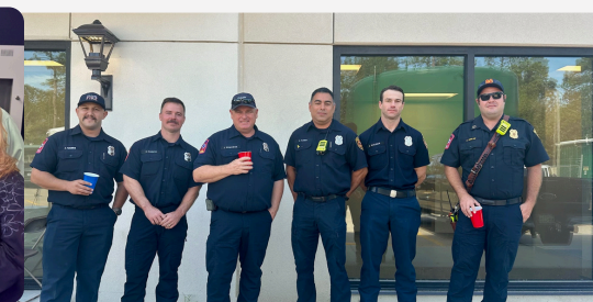
First Responder Appreciation