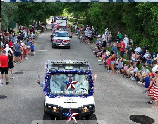
Independence Day Parade