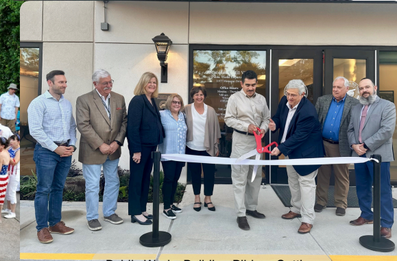
Public Works Building Ribbon Cutting