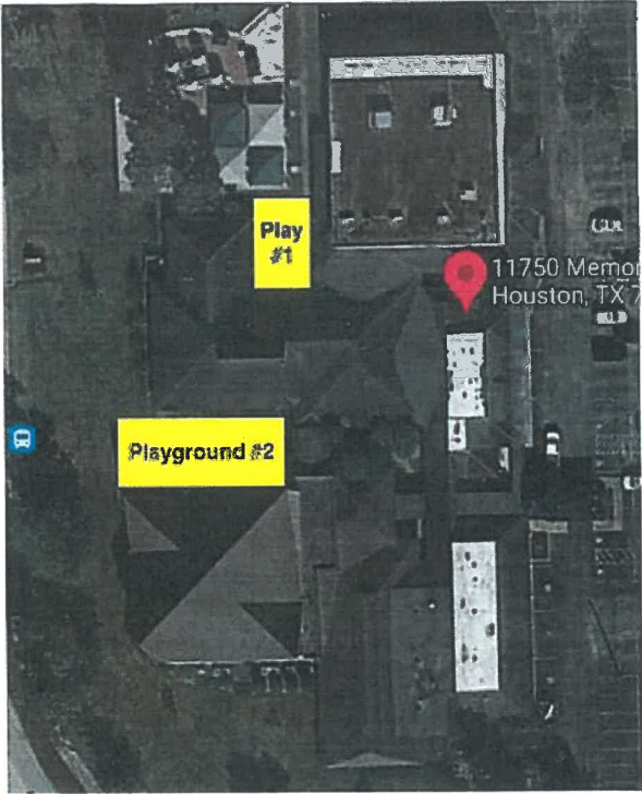
Exhibit A – 2 Playground Areas

Specific Use Permit – Ordinance No. 21-xxxx Paratus Memorial 11750 Memorial Drive Amendment to SUP xxr 2022